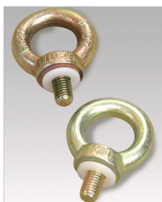
Optional chain rings (FIX1117).

Optional chain rings are available for connecting chains or ropes to our bollards. Simply order with chain rings. Chain rings can also be purchased separately for retro fitting to existing bollards by drilling and tapping M10 threads as required.