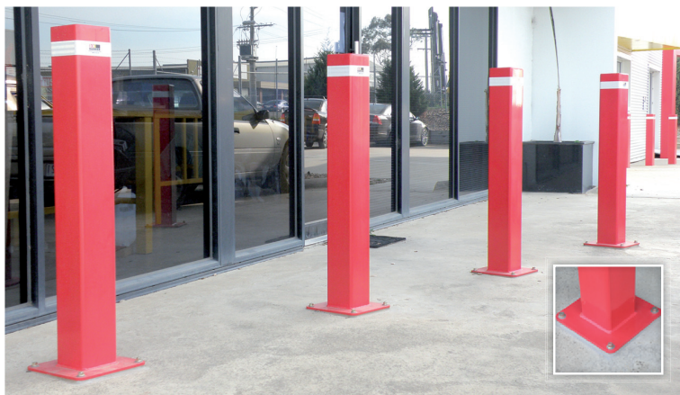
CS150SM Bollards shown.

Our fixed surface mount bollards are designed for traffic control situations or property and asset protection. Manufactured from heavy wall mild steel tube with fully welded base plates, these bollards are able to take the hard knocks. Suitable for installation onto any concrete surface. Available in round or square designs. All our bollards are supplied complete with necessary fixings and are available in a hot dip galvanised finish or hot dip galvanised with a powder coat finish.