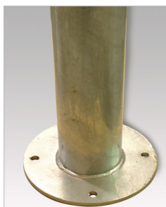
Surface mount flange.